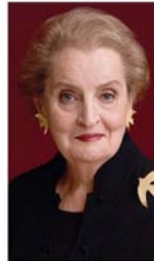
Portrait by Timothy Greenfield Sanders

Click here to buy tickets online or call (773) 248-5200 x303 to purchase tickets over the phone.